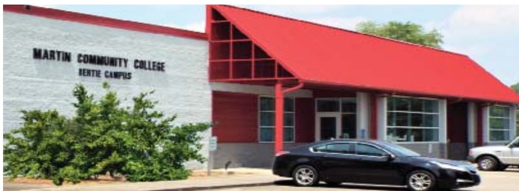
Windsor Campus, Bertie County